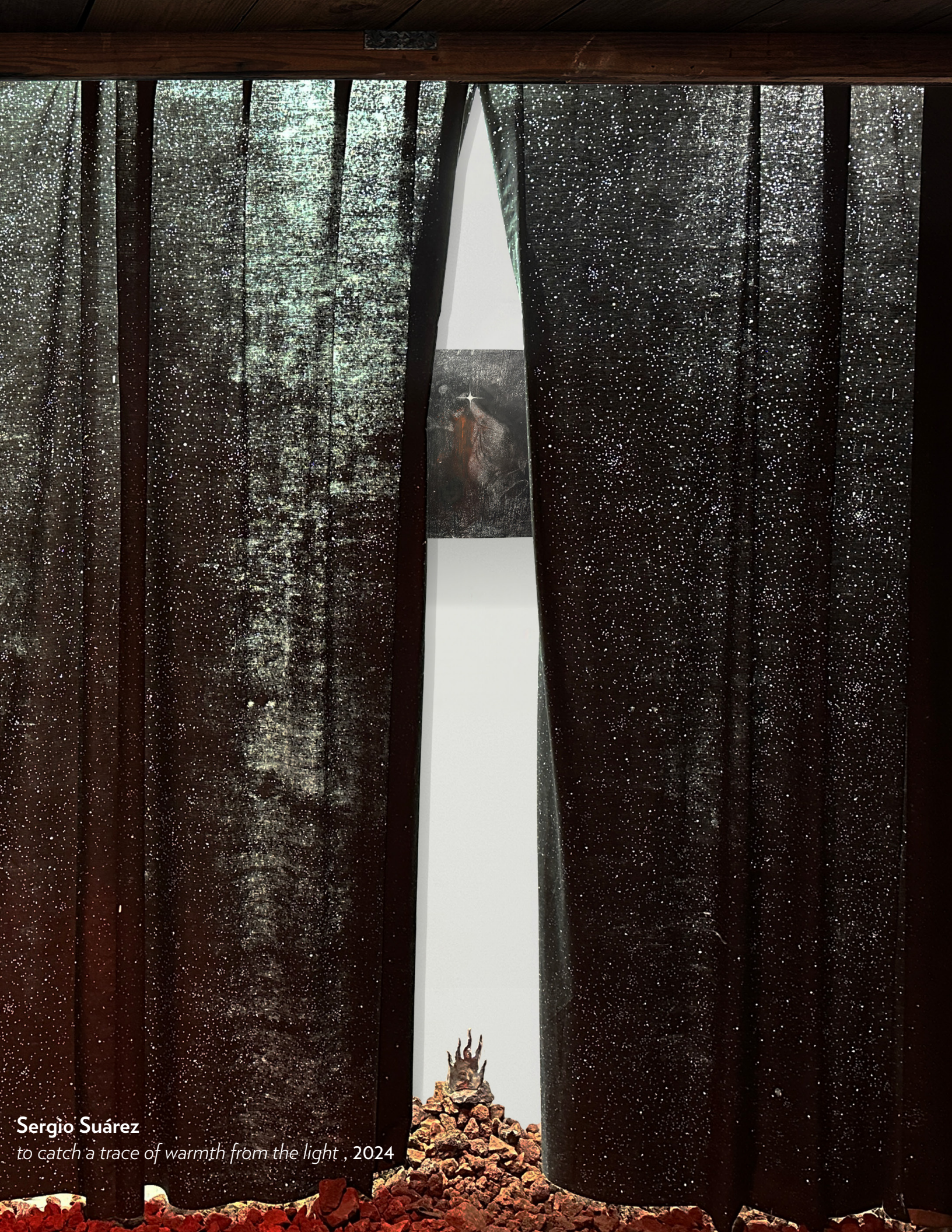
Sergio Suárez to catch a trace of warmth from the light , 2024