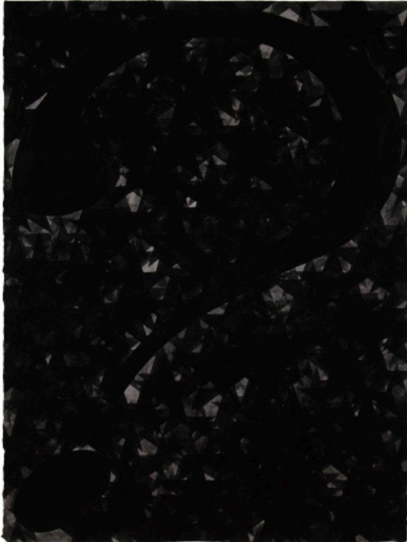
Yan Wen Chang The Condition (01) , 2024 Gouache on arches paper. 30 x 22.5 in.