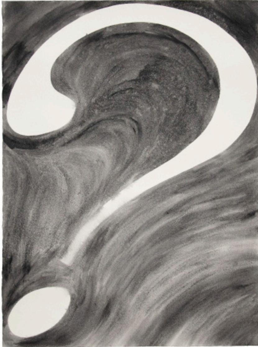
Yan Wen Chang The Condition (09) , 2024 Gouache on arches paper. 30 x 22.5 in.