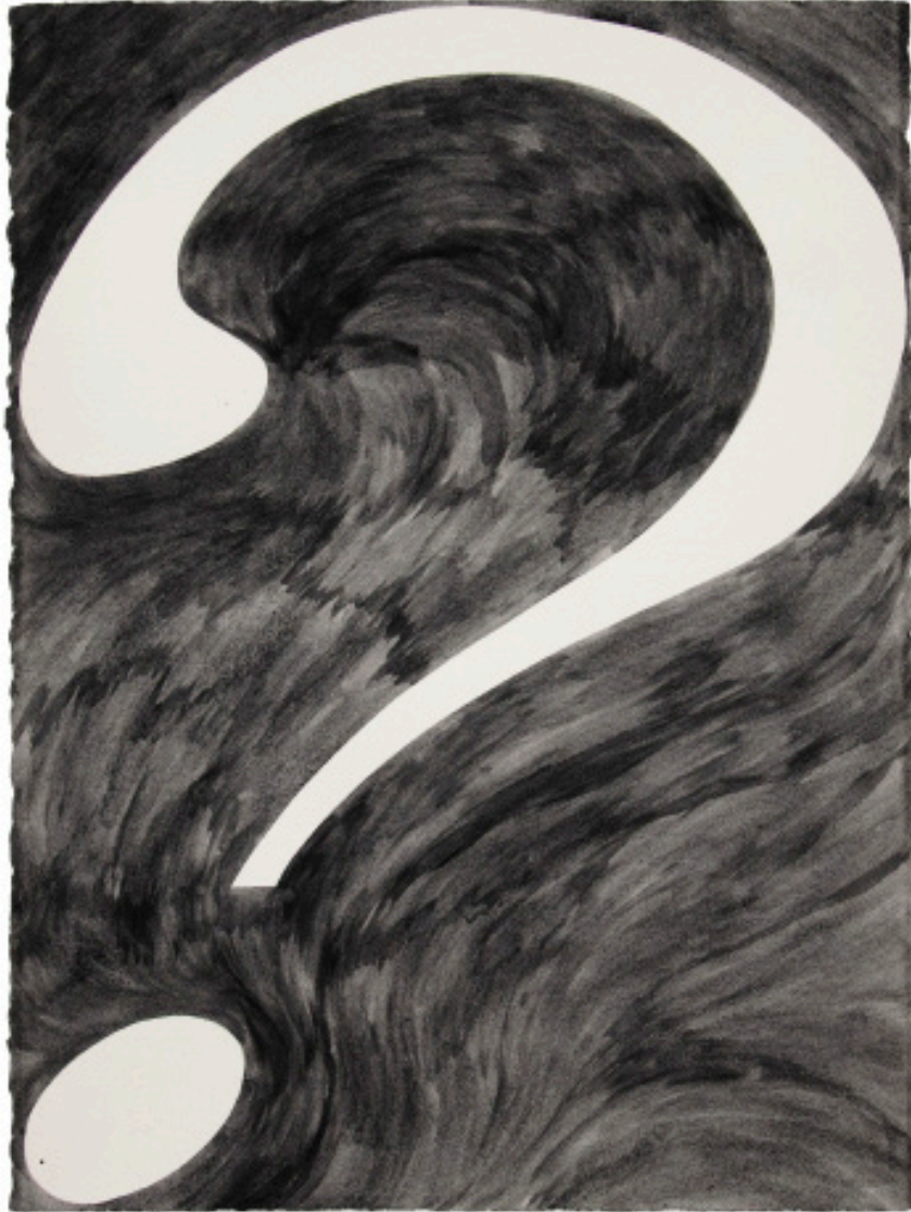
Yan Wen Chang The Condition (10) , 2024 Gouache on arches paper. 30 x 22.5 in.