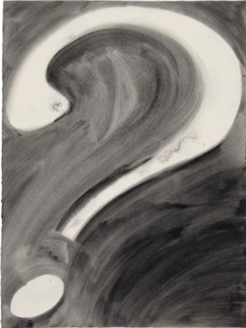
Yan Wen Chang The Condition (o6) , 2024 Gouache on arches paper. 30 x 22.5 in.