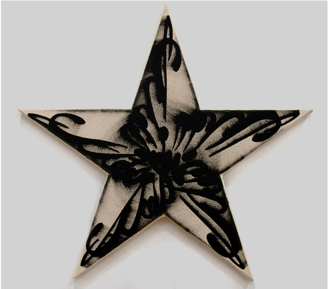
Yan Wen Chang Thanatos , 2024 Oil on canvas. 23.5 in. width