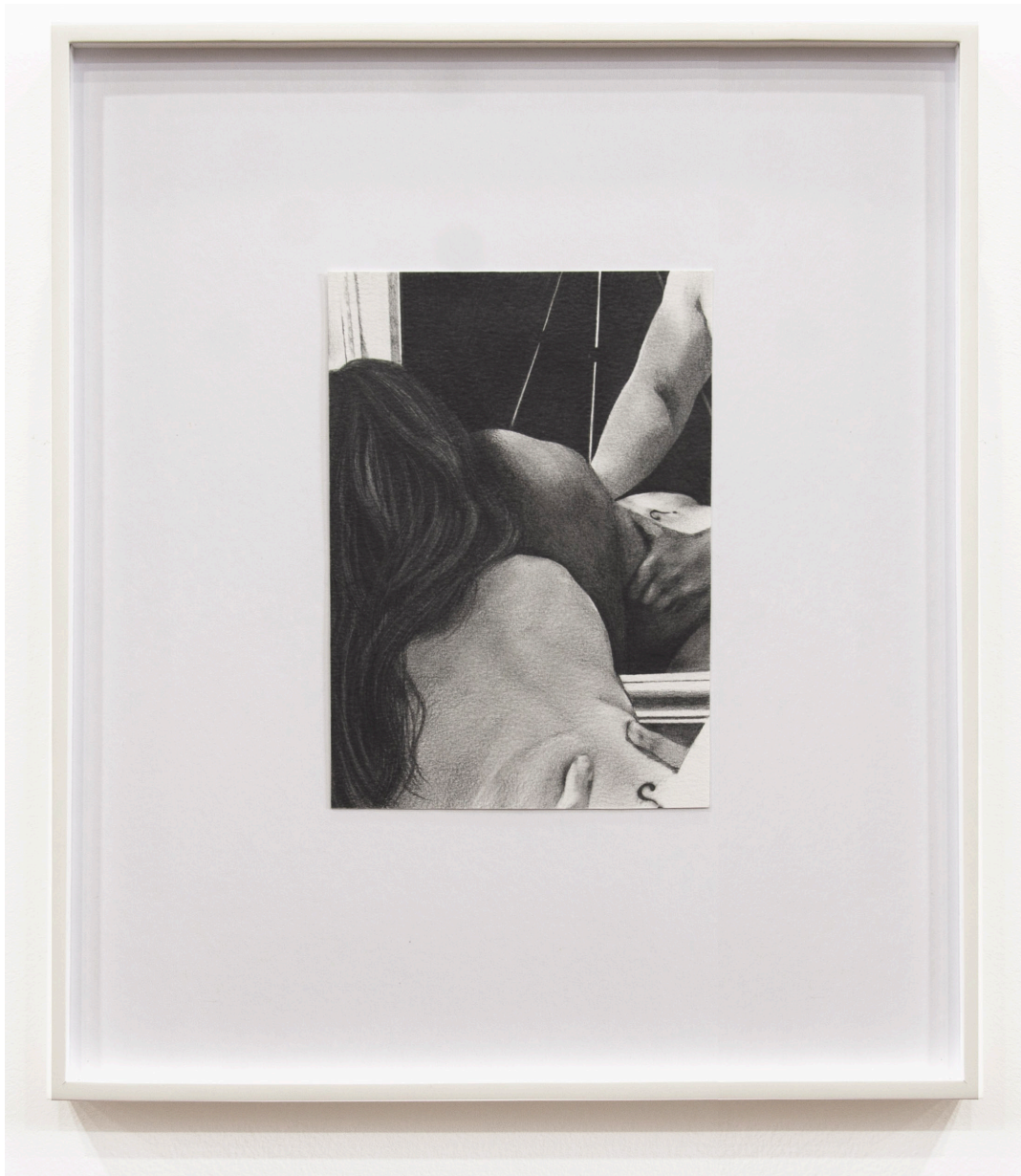
Yan Wen Chang Amateur Question Mark, 2024 Graphite on paper. 17.5 x 14.75 in.