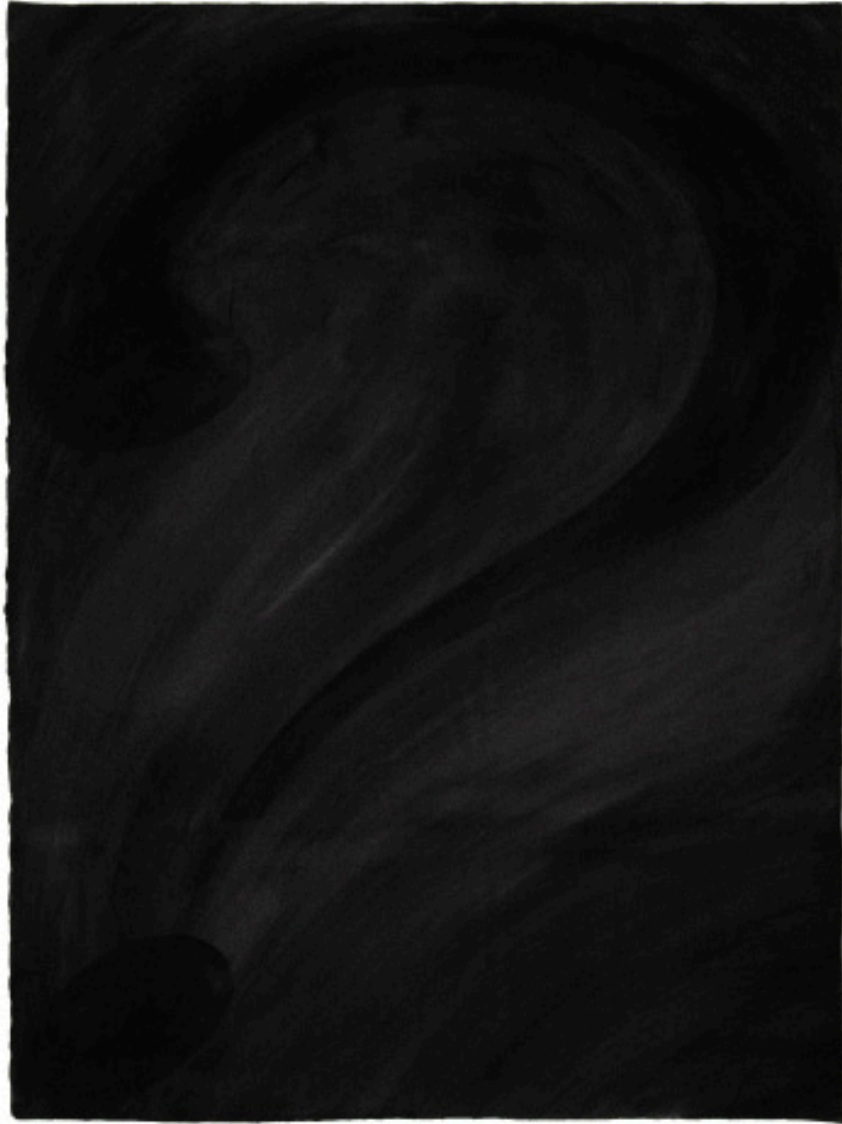
Yan Wen Chang The Condition (I2) , 2024 Gouache on arches paper. 30 x 22.5 in.