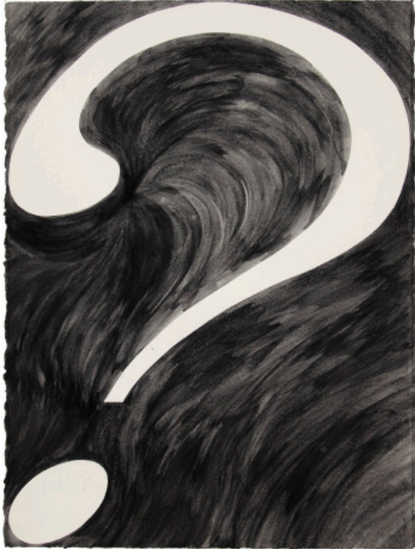
Yan Wen Chang The Condition (05) , 2024 Gouache on arches paper. 30 x 22.5 in.