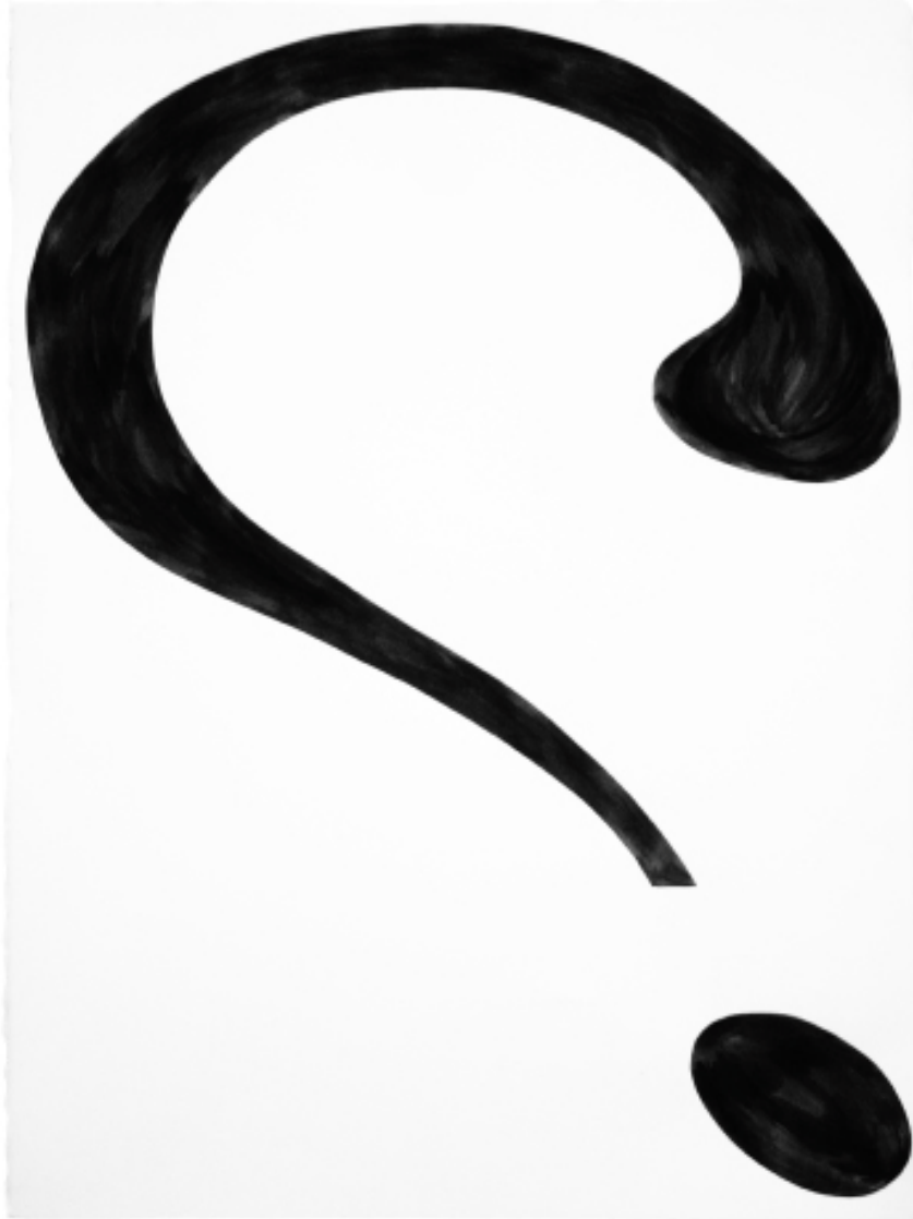
Yan Wen Chang The Condition (II) , 2024 Gouache on arches paper. 30 x 22.5 in.