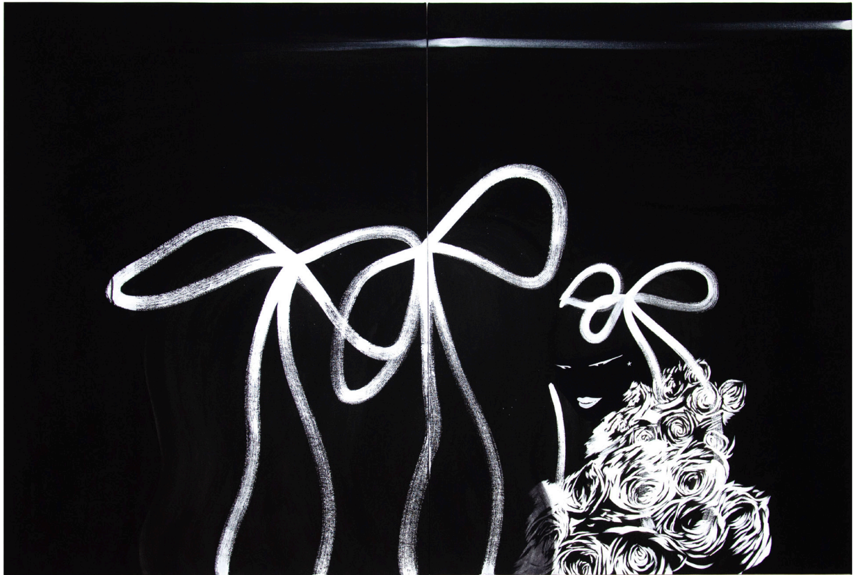
Yan Wen Chang Portraits of Selves in Elevator, 2024 Gouache on canvas. 48 x 72 in.