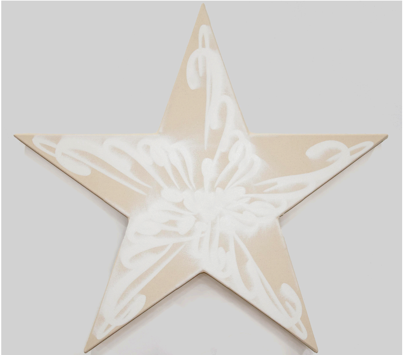
Yan Wen Chang Eros , 2024 Oil on canvas. 31.75 in. width