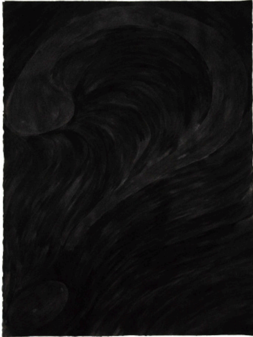
Yan Wen Chang The Condition (I3) , 2024 Gouache on arches paper. 30 x 22.5 in.