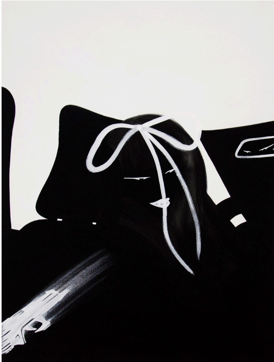
Yan Wen Chang Portrait of Selves at Final Destination, 2024 Gouache on canvas. 48 x 36 in.