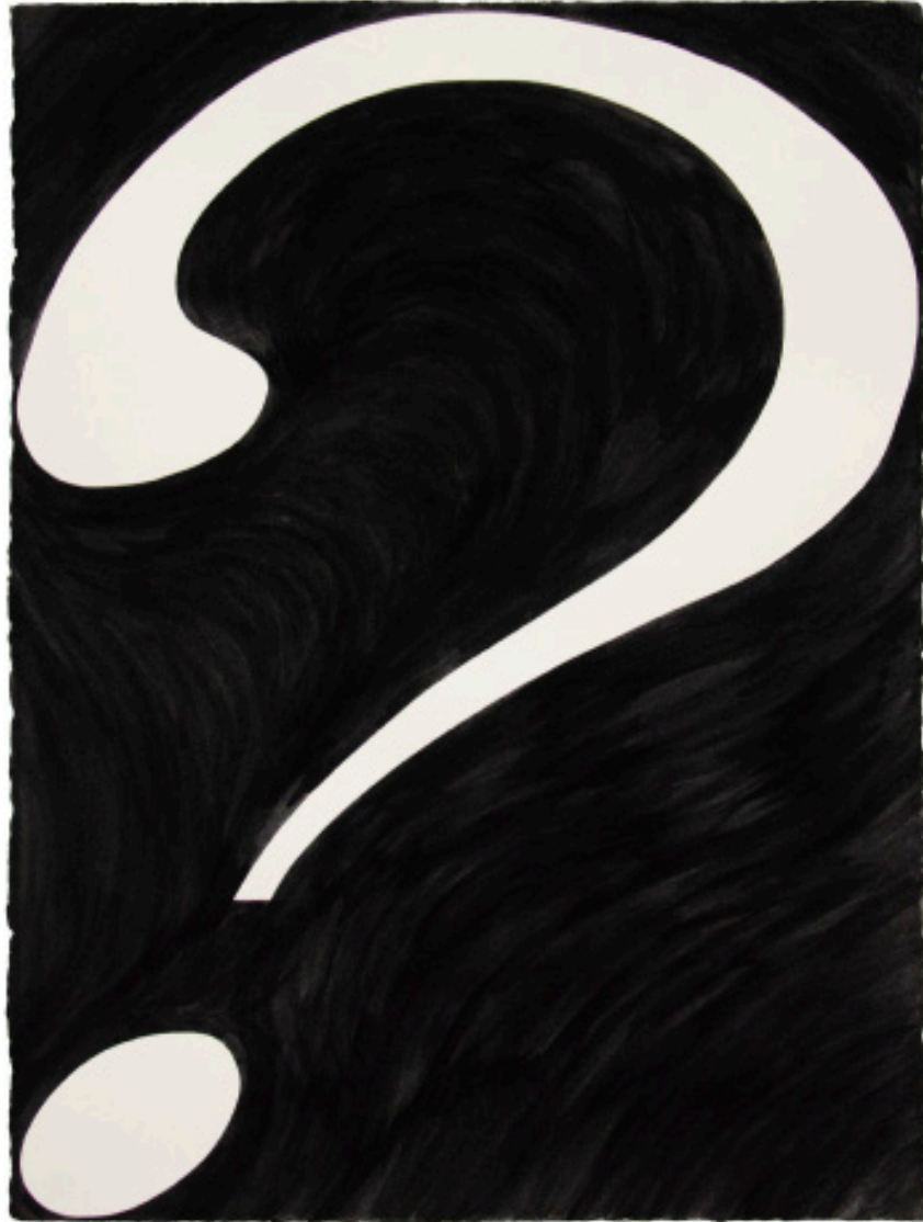
Yan Wen Chang The Condition (03) , 2024 Gouache on arches paper. 30 x 22.5 in.