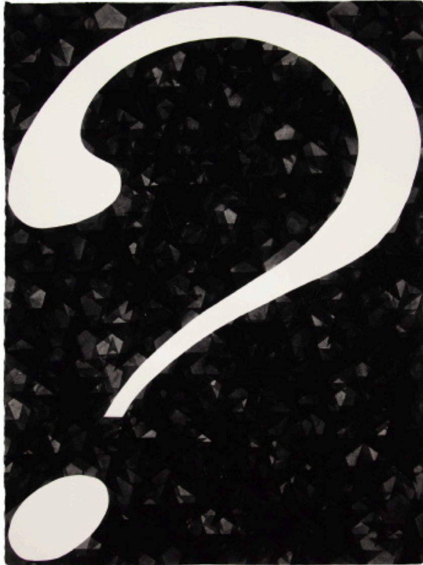
Yan Wen Chang The Condition (o8) , 2024 Gouache on arches paper. 30 x 22.5 in.