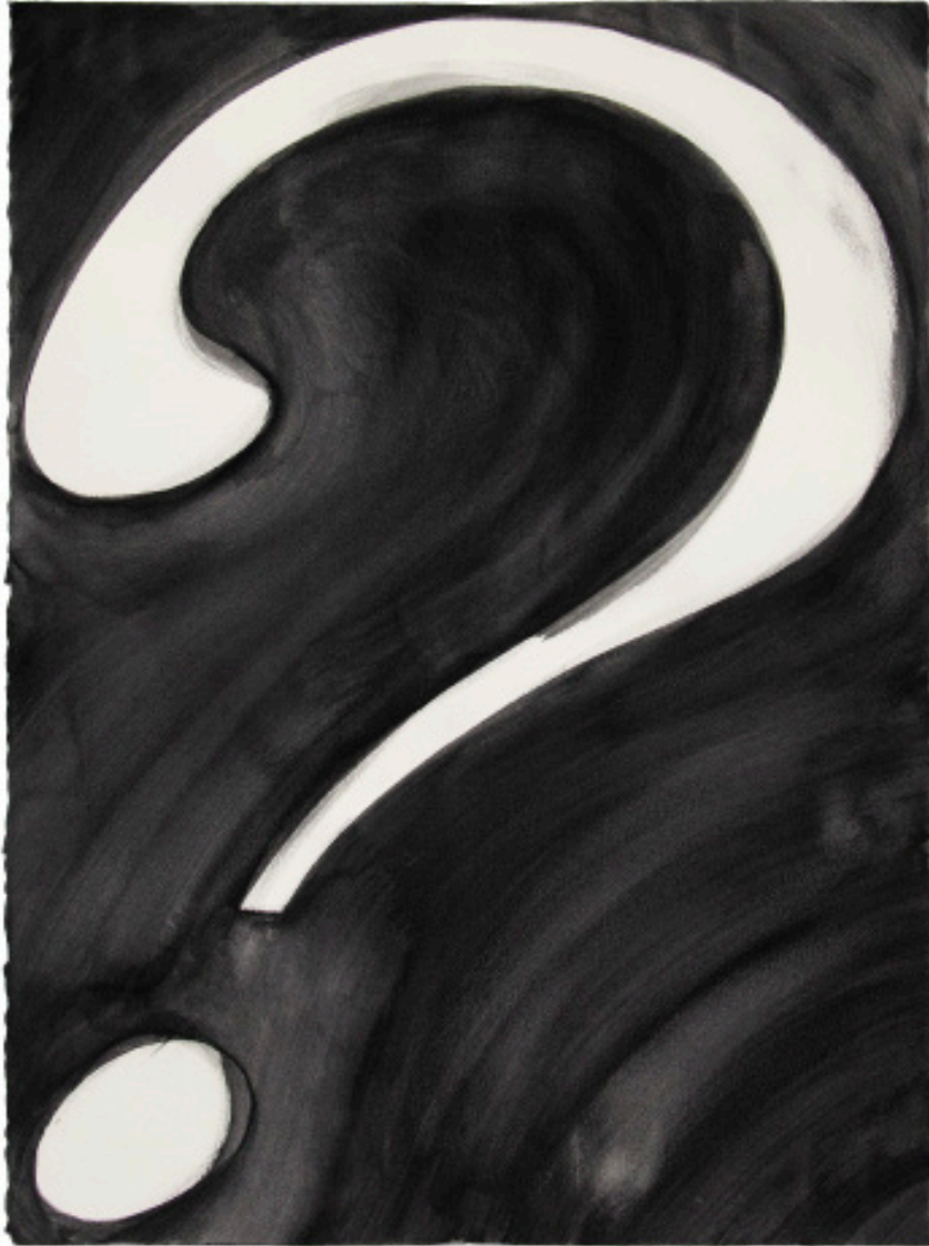
Yan Wen Chang The Condition (o2) , 2024 Gouache on arches paper. 30 x 22.5 in.