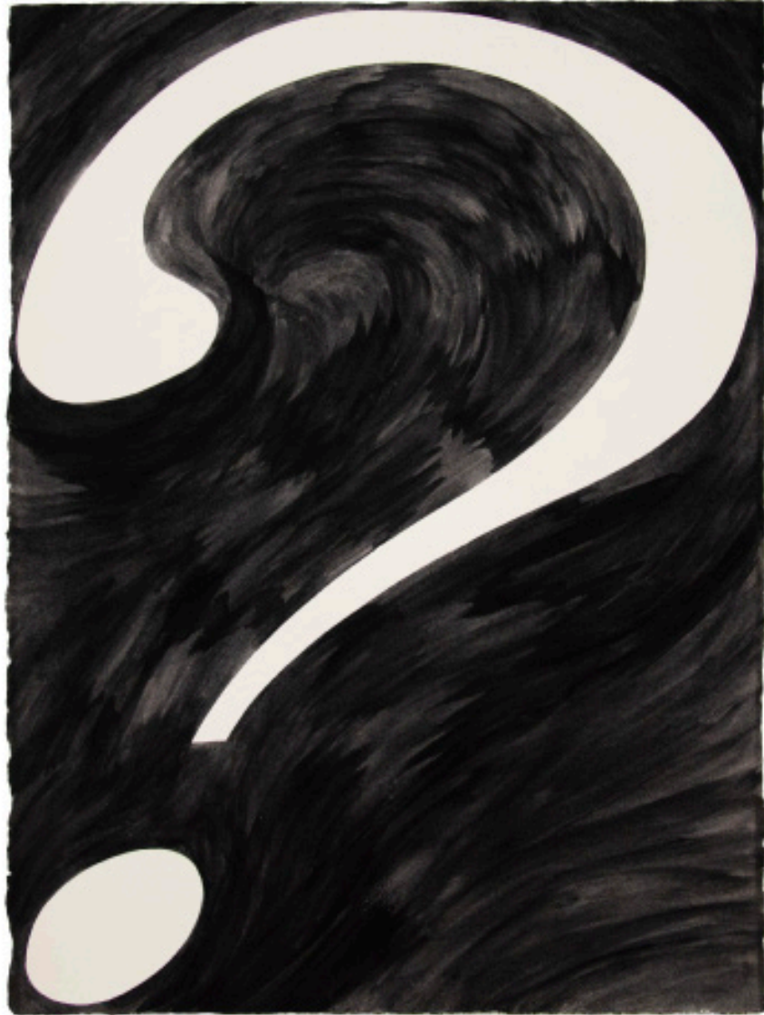
Yan Wen Chang The Condition (07) , 2024 Gouache on arches paper. 30 x 22.5 in.