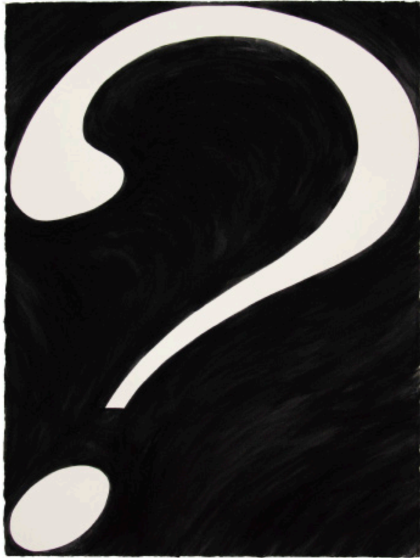
Yan Wen Chang The Condition (04) , 2024 Gouache on arches paper. 30 x 22.5 in.